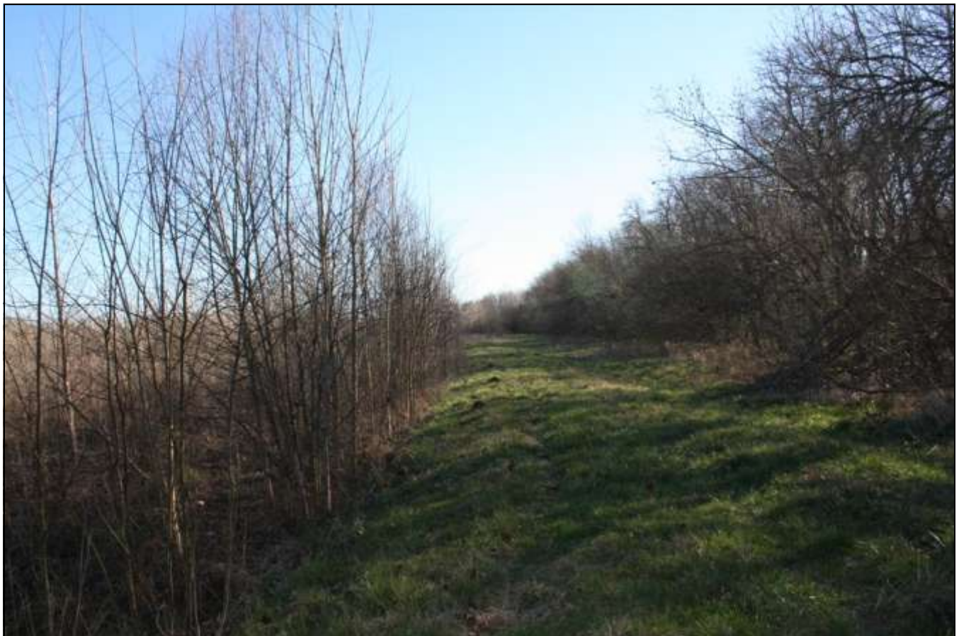
View of the road/levee that runs along the portion of the property that is in the Wetlands Reserve Program