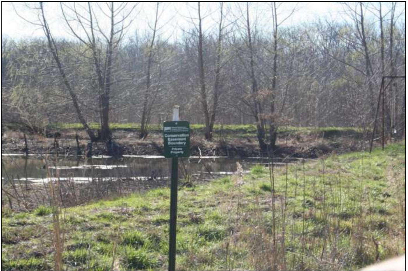
Conservation Easement Boundry; 14 acres of prime waterfowl habitat with the ability to plant and control the water level via the levees and gate valve