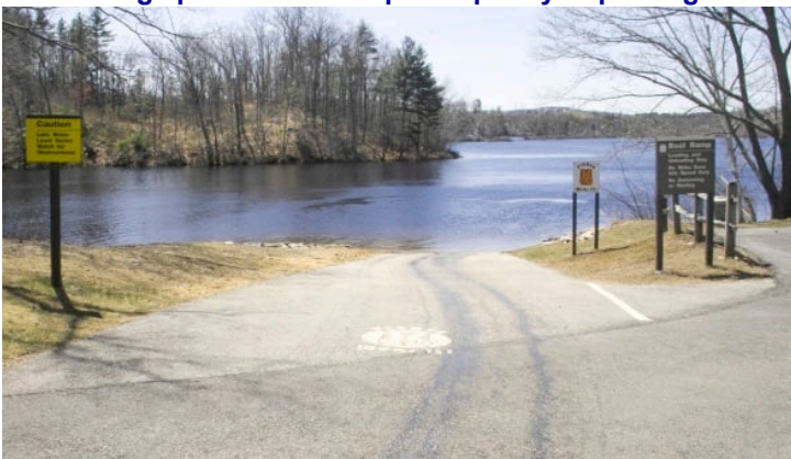
This boat ramp is busy most days when there is no ice.