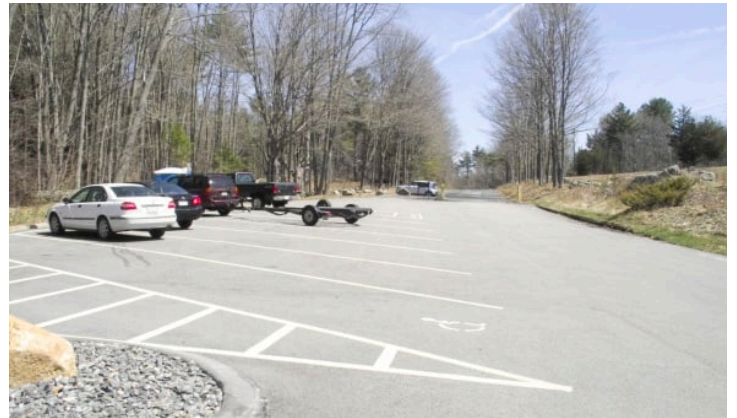
A large paved boat ramp with plenty of parking.