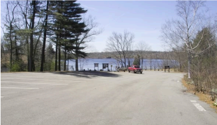
A large paved boat ramp with plenty of parking.